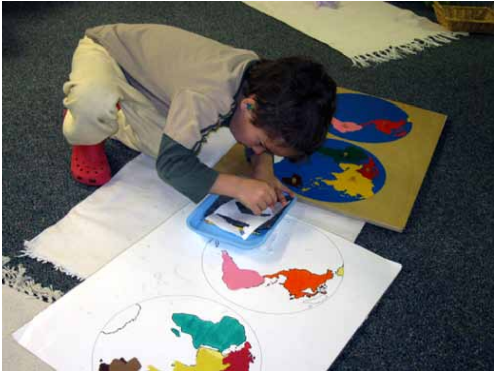
Top: PPB's Kyce crafted this Wintertime snowman. Above: Exploring continental geography in PPE.