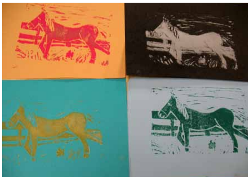
Clockwise from top: LE 1 students enjoy their Thanksgiving Tea; Douglas and Priya give a presentation at LE2's Thanksgiving Tea; Middle School's Grace created a colorful horse print; Lower El 2 observes chemical reactions.