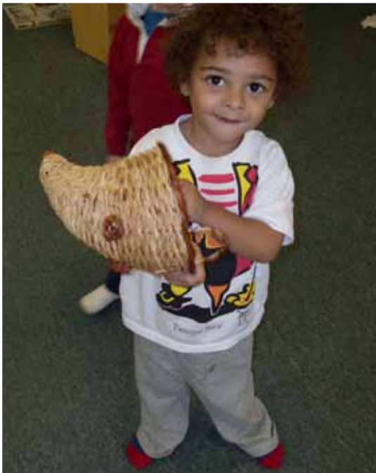
Above: Learning about a cornucopia in Toddler1. Top Right: The infant room makes fresh cinnamon applesauce.